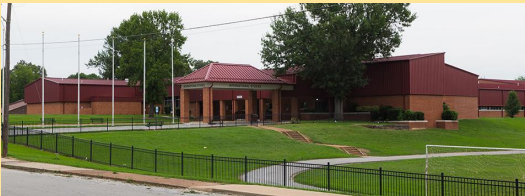
International Studies Magnet